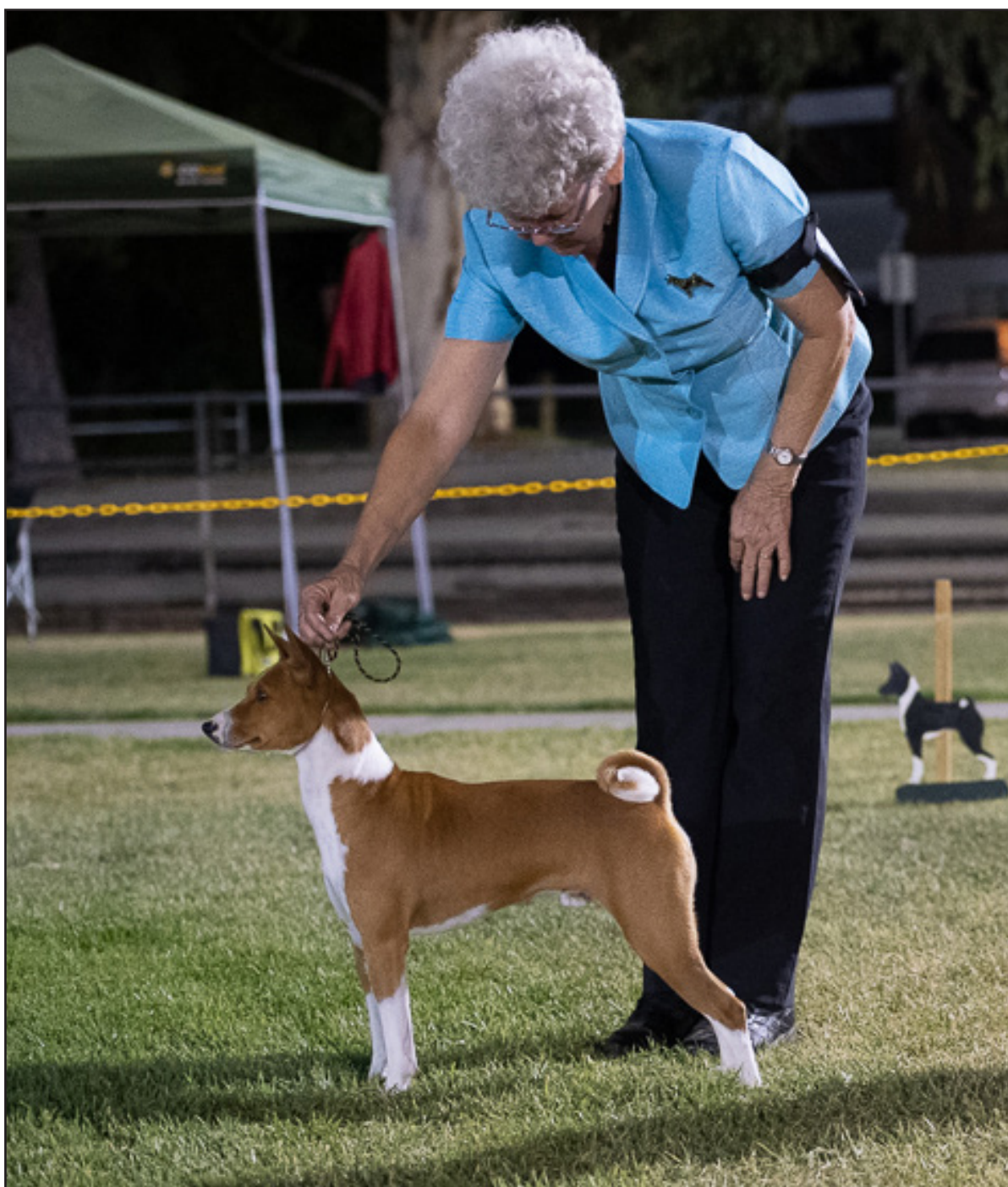
Best in Show at the 52nd BCOV Champ Show: CH LOMAR CUT THE MUSTARD