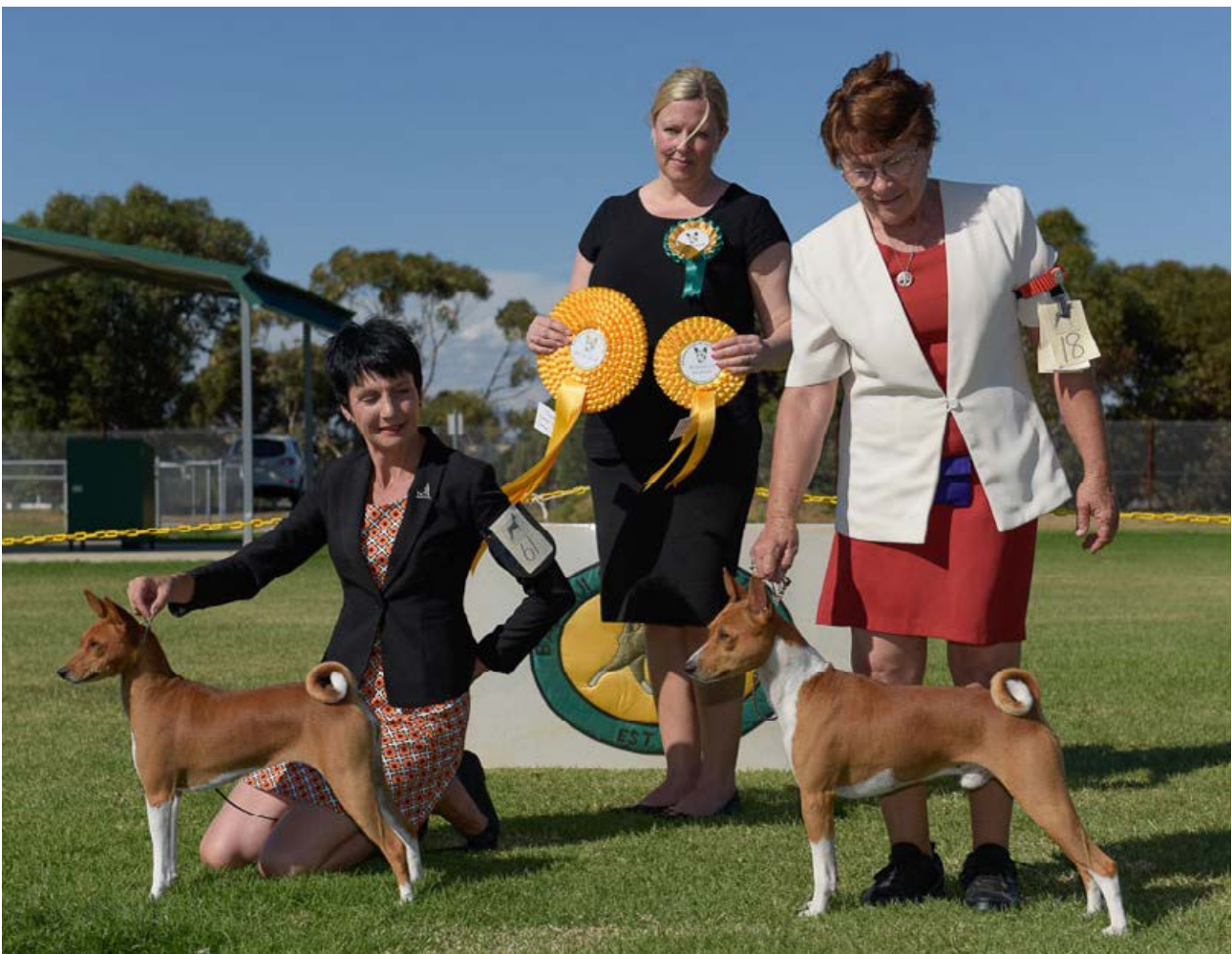
Best Exhibit in Show: Ch Zanzipow Bowies China Girl Runner Up in Show and Best Opposite Sex in Show: Gr Ch Remwin Cheeky Liasons

On a general note: I was very pleased to see so many with lovely small, well set ears. Very glad to see a few excellent movers. Really good moving basenjies make me happy! Also I did not comment on temperament in the critiques, but most had lovely temperament even though you were just in the beginning of your breeding season. Did not have a single one where temperament, while examined on the table, wasn't acceptable. I feel that is a